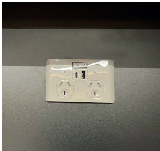
The dual USB charger features both Type A&C charging ports, with the type A catering for the very latest mobile phone charging ports. USB outlets deliver an impressive 3.4A charging on one device.