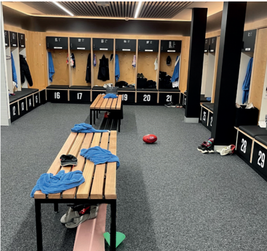
Power and USB charging is concealed in the player's individual locker, and accessed via security keypad.