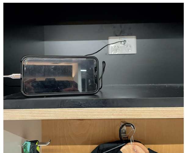
Note that the power outlets are auto-switched. Each outlet becomes active when a plug is inserted. This provides a slimmer and cleaner looking design profile.