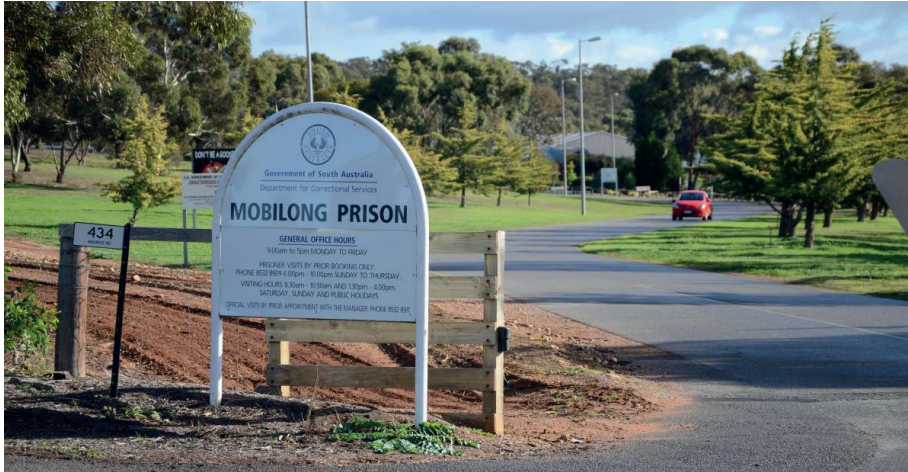
Mobilong Prison, is an open campus style prison in Murray Bridge, SA.

Case Study: Mobilong Prison Electrical Contractor: Electrical Allsorts Trader Electrical Products used: Puma Vandal Proof