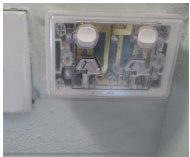
Clear power points with solid plate construction and shuttered outlets provide a tailored solution for prison management.