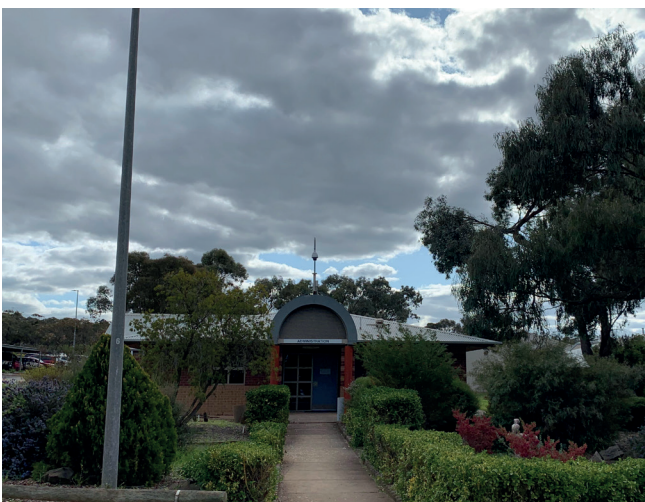
The facility incorporates a mix of prison cells as well as independent living units.

Trader GSM became aware of similar issues from other correctional facilities across Australia. After listening to electrical contractors requests, Trader adapted its Puma Vandal Proof range to suit.