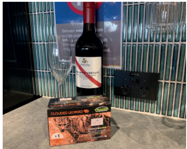
Available in matt black and matt white, Clouded Leopard matches the latest trends in matt paint finishes, laminates and textures