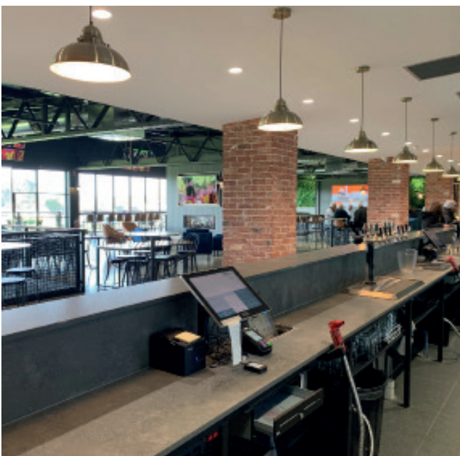
The Precinct celebrates the Port Adelaide Football Club's rich history and location.

Here at the Precinct, it is used extensively in the dining room and bar areas, café areas and the downstairs museum.