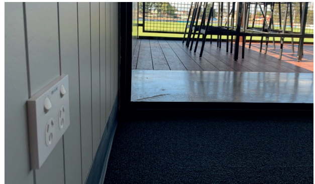
Integrated USB charger and auto-switched power points feature a Type A&C charging ports.