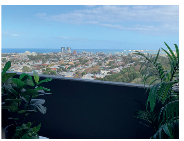
R.Iconic offers panoramic views of the beach, city and parklands nearby.