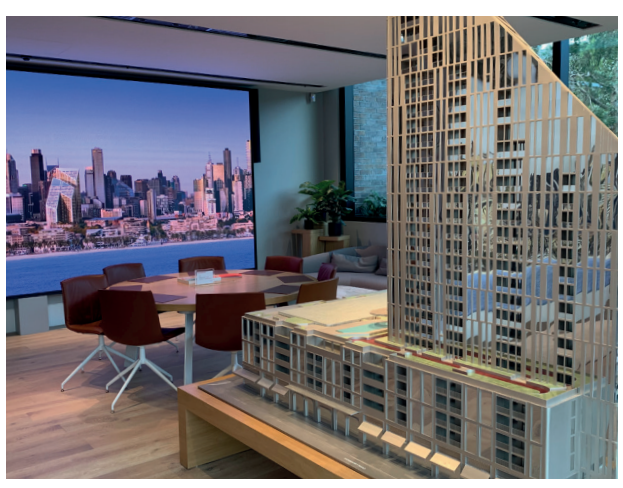
R.Corporation has a 20 year track history and delivered over 30 buildings.