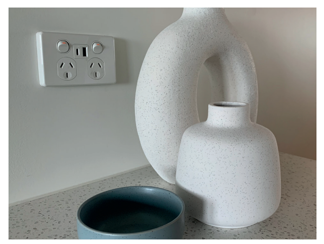
USB chargers deliver 3.4A of charging to a single device.