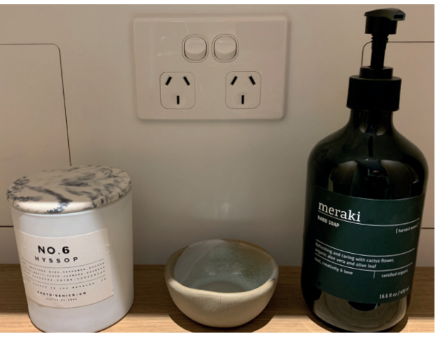
Flat Cat fits unobtrusively inside cabinets.