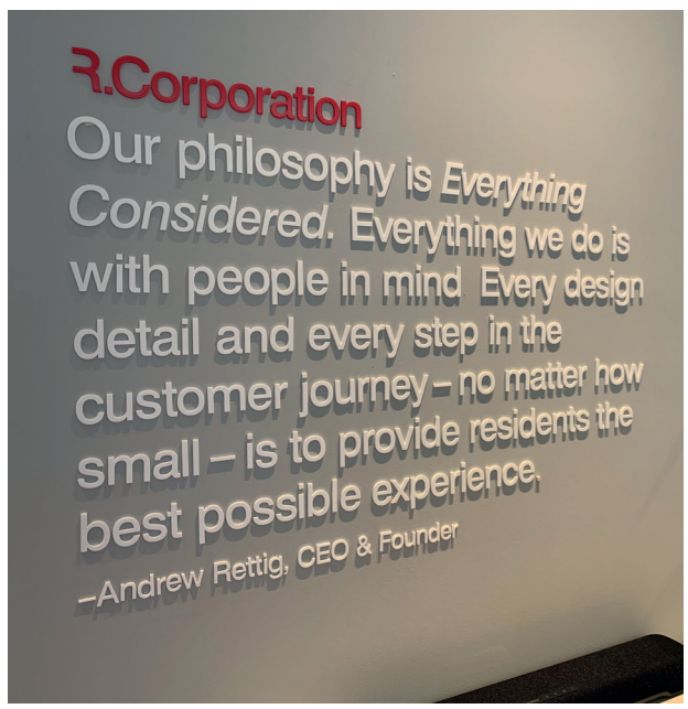
"Every design detail is to provide residents the best possible experience."

All Flat Cat product was procured and delivered through AWM McKinnon Electrical wholesalers.