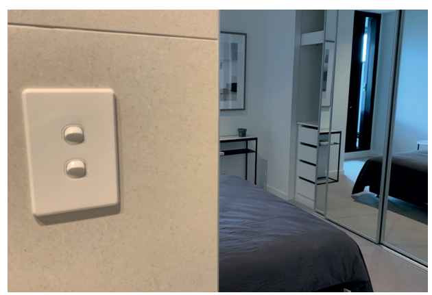
Flat Cat's sleek design suits tiled installs.

With floor to ceiling windows, each apartment lets in plenty of natural light. Neutral colours and black trims makes this a very contemporary place to live.