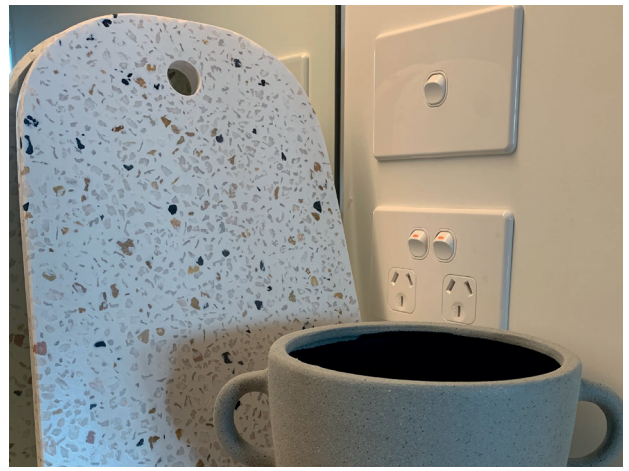
Sleek, contemporary Flat Cat design.