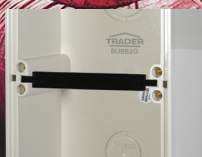
BLACK BRIDGE PIECES On switched sockets sit nice and snug