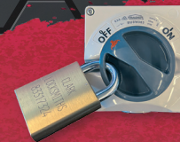
LOCKING FACILITY On BUSW products, designed around standard 70mm padlocks