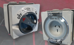
A NEW LOOK Instantly recognisable as Buffalo, mix and match with other brands