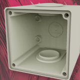
EXTRA DEEP SINGLE BACKBOX eg. BUBB1GD for rotary cam switches