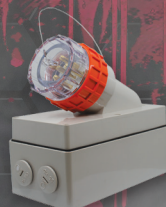
NEW APPLIANCE INLETS Designed to fit various plug designs