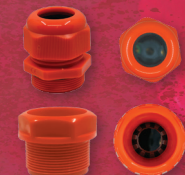
TWO CORD GLAND SIZES Larger gland entry supplied with 32-50A plugs