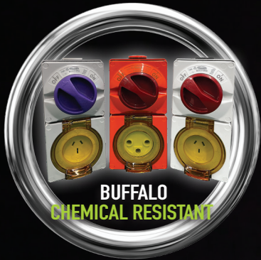
BUFFALO CHEMICAL RESISTANT