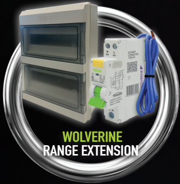
WOLVERINE RANGE EXTENSION